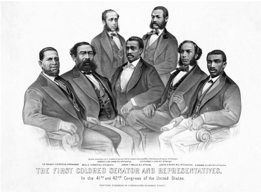
Blacks elected to the U.S. Congress in 1870 and 1872. Hiram Rhodes Revel is on the far left, and Joseph Rainey is second from the right.

The cumulative effect of these constitutional amendments was to make former slaves fully equal American citizens in the eyes of the law. Because most Southern states had substantial black populations, black candidates began to win state and local elections. The first black man to be seated in the House of Representatives, Joseph Rainey of South Carolina, was elected in 1870. In the same year, Hiram Rhodes Revel of Mississippi became the first black U. S. Senator. "In all, 16 African Americans served in the U.S. Congress during Reconstruction; more than 600 more were elected to the state legislatures, and hundreds more held local offices across the South." 1 Everyone was a Republican.