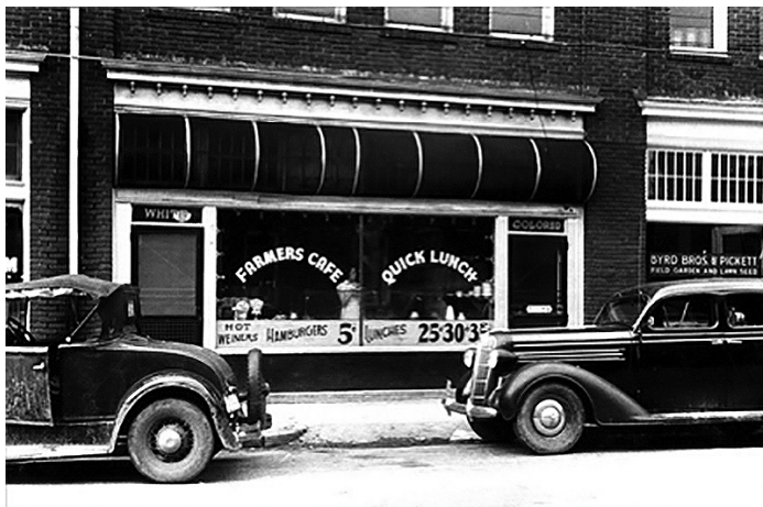
Segregated restaurant with separate entrances for whites and colored.